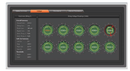
Specifications subject to change without notice

One Battery Xplorer Enterprise Lithium-Ion software module is required per license.